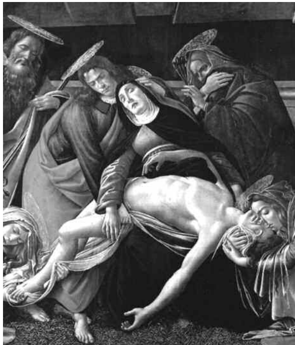
Sandro Botticelli, Lamentation over the Dead Christ with Saints c. 1490

Sometimes, history has shown, it takes the ultimate sacrifice to bring an end to tyranny and oppression. Death brings life. Oh, we yearn for a far better way, but in the face of evil whose intent is even greater evil, such sacrifice is the price to be paid.